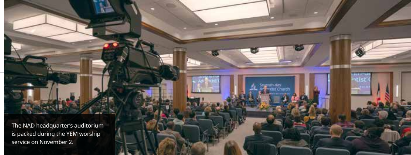
The NAD headquarters auditorium is packed during the YEM worship service on November 2.

This counselor does not just lead us into an intellectual understanding of these principles. He demonstrates them in His life and