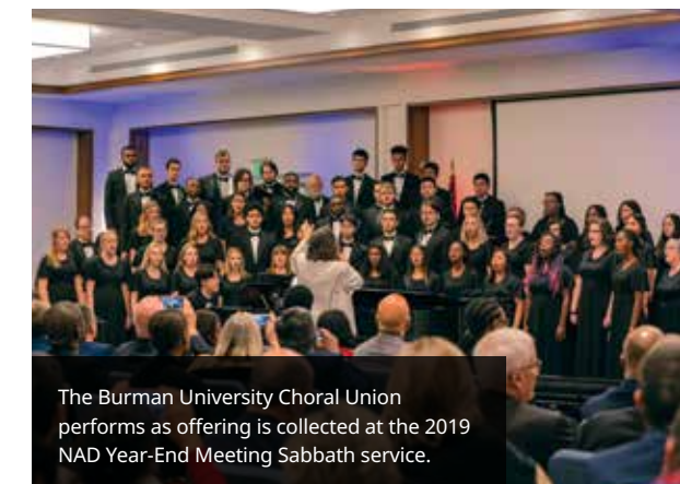
The Burman University Choral Union performs as offering is collected at the 2019 NAD Year-End Meeting Sabbath service.

When I contemplate these things and think about the ongoing, seemingly never-ending debates in the church, all taking place within the context of human, natural, and supernatural disasters, I am often